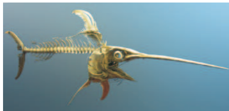
Swordfish skeleton at the National Museum of Natural History, Washington, DC.

There is no evidence that swordfish evolved. Fossils of similar fish have been found in the same rocks as dinosaurs. We believe these weird, yet wonderful fish were made by God on the fifth day of creation.