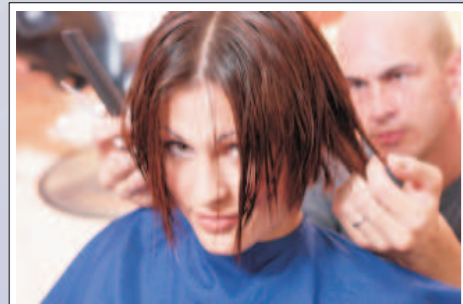
God knows how many hairs are on your head!

This doesn't mean that He is too great to care about us, though. God cares about everything He created, even the birds, but He cares for us even more. Jesus said, "When five sparrows are sold, they cost only two pennies. But God does not forget any of them. Yes, God even knows how many hairs you have on your head. Don't be afraid. You are worth much more than many sparrows." (Luke 12: 6-7).