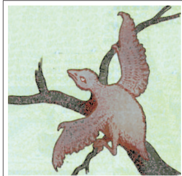
Young hoatzin with wing claws (Drawing by Brian Newton)

Hoatzins are unusual in other ways, too. When they first hatch out, young hoatzins have claws on their wings. What are they for? Sometimes, before the young birds have learned to fly, some animal may attack them in the nest. If this happens, the young hoatzins jump out of the nest into the river below. They are very good swimmers, so they quickly swim to the bank, and climb back up to their nest, using their wing claws to help them hold on to the twigs and branches. When they learn to fly, they lose their wing claws, since they no longer need them.