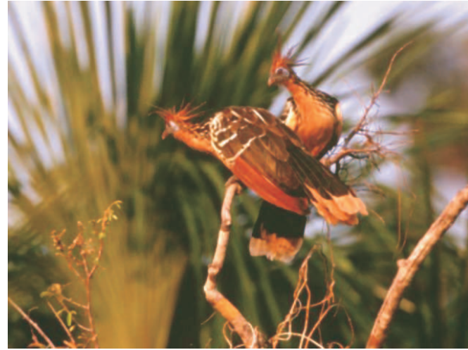
A pair of hoatzins in the rain-forest

Some people call hoatzins "primitive", because they believe birds evolved from reptiles. They say the hoatzin is like a fossil bird called archaeopteryx , which also had wing claws, and was once thought to be a "missing link" between reptiles and birds. We now know that this creature was a real bird, and not even the