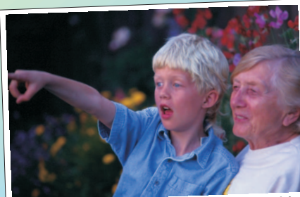
Our bodies will wear out and grow old

our faith in Jesus, who died and rose again, our real self will go on living in heaven. 'We know that our body — the tent we live in here on earth — will be destroyed. But when that happens, God will have a house for us to live in.... It will be a home in heaven that will last for ever.' (2 Corinthians 5: 1). God won't allow the universe to continue until it dies. His Son, Jesus will return to earth some day, to take those who love Him to heaven. Then God will create a brand-new world, where nothing will ever wear out or die again. We can live for ever with God, just as he intended us to. Make sure you will be part of it by putting your faith in Jesus now!