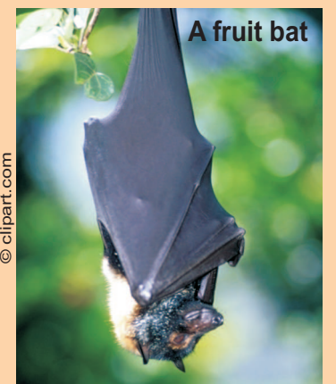
A fruit bat

Fossils show that many animals that lived in the past had teeth which looked as though they were designed for eating meat. But before sin came into God's world, there was no killing or suffering. So these teeth would have been used only for eating plants—just as some living animals do.