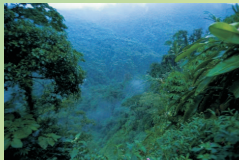
A tropical rain forest