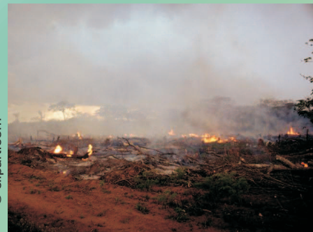
Rain forest being cut down and burned

Trees also affect the weather by bringing down rain, and help prevent soil being washed away in heavy rain. In some countries, there are huge rain forests, which stretch for thousands of miles. They are home to many wonderful animals and birds. Sadly, people are cutting down and burning large parts of these forests. This means that less rain falls in these areas, and it also destroys the homes of many rain forest creatures. In the beginning, God said "Let the earth produce plants". (Genesis 1: 11), and trees are a very important part of God's creation. Without them there would be no other life. So we ought to look after the rain forests and other areas of trees. Next time you see some green leaves, remember how important trees are to us all!