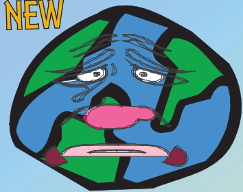
A sad world because of sin

Imagine that your family moved into a lovely new house with newly-painted walls and doors and new carpets and furniture. Now suppose that one day, after you had been out, you came home and discovered that intruders had broken in. They had walked all over the carpets with muddy shoes, torn the curtains from the windows, ripped the furniture, and dirtied the walls. Your Mum and Dad would be angry and demand that those who spoil your lovely home be punished.