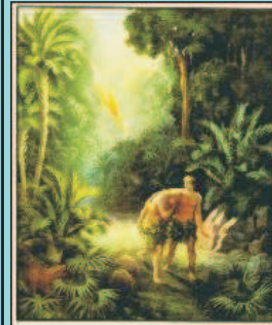
After they disobeyed God, Adam and Eve had to leave the beautiful Garden of Eden, and work hard to stay alive.

GOD is good, and everything He made was good. The first people, Adam and Eve, had everything they needed—lots of wonderful fruit and plants to eat. There was just one thing God told them not to do — eat fruit from the "Tree of Knowledge", otherwise they would die.